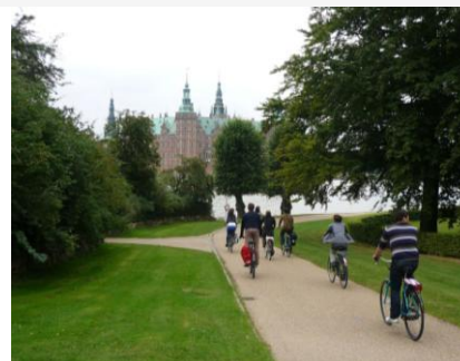
Ved Frederiksborg Slot.