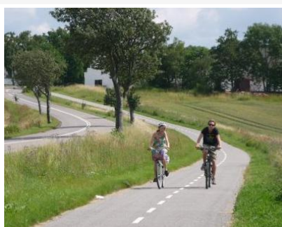
Cykelrute 32 mellem Helsingør og Laugø.