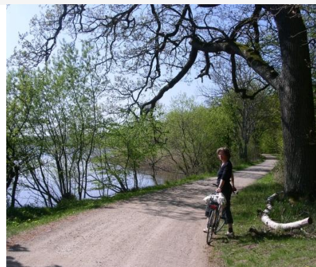
Søvejen langs Esrum Sø.

Beeches are leaning over the lake and frame the view. Tables and benches in several places along the lake perfect for resting. Here along the lake decorated the Royal Frederiksborg Stud in his time 6 stile fenced by stone wall for summer grazing and small houses that now lies on Lake road (Søvejen), was built for upright men who would take care of the horses.