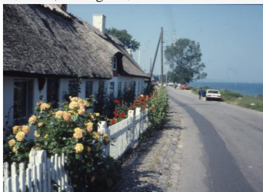
Fiskerhuse ved Humlebæk.

Follow Gurrevej out past Gurre Castle Ruin and on through Tikøb to Fredensborg Palace where Queen Margrethe live in the summer. Continue through Sørup and cycle path along Hillerødvejen. Shortly before the small castle Egelund, built 1916 to the Dowager Queen Louise, turn right by Stenholttsvej to Nødebo, through Nødebo and down along Esrum by the lake.