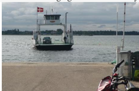
Kulhus færgen Columbus

Some of the best beaches can be found here all the way along the north coast. There is also a lively summer atmosphere on good days with ice cream stalls and craft shops etc. Just follow the coast path (R 47) all the way to Hundested, where cars are banned through the forest. Beware through Troldeeskoven. A detour to Asserbo ruined castle, now we have castle theme going. From Sølager on the south side of Halsnæs and not far from Hundested take the ferry to Kulhuse. From here, follow the N2 or R40 into Nordskoven to the age-old oaks, of which Kongegegen is still alive, even if it does go on crutches. But it's impressive enough with bright green crown after 2000 years. South of the forest is Jægerspris Castle with Frederik VII and Countess Danner's memorial room - and organic café. Go on to Frederiksund - the city with the Vikings game. From here you can take the S-train to CPH one hour. Bikes are free.