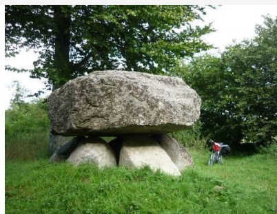
Karlstenen i Grønnesse Skov

More information: www.friefugle.dk/cykelsafari